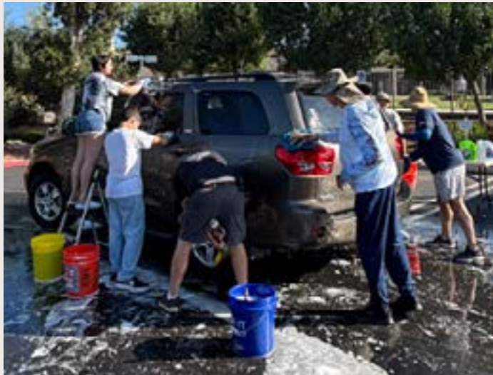
SEPTEMBER FUND RAISER CAR WASH