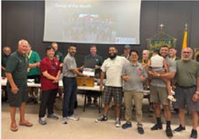
August Awards Group of the Month